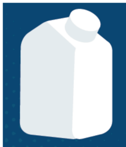
*TISSUE CULTURE MEDIA BOTTLES